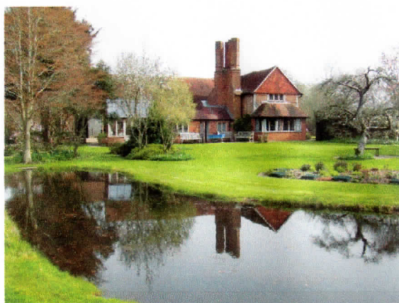
Beautiful View of Frosbury Farm House

The whole scene was pleasing to the eye including their picture box cottage and granary. We would love to go back on a milder Spring day in the future to see their collection at their very best.