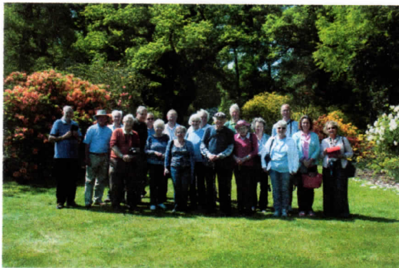
Group Photo After Garden Tour

After advising us about various trees and plants in the garden he asked if there was anything else he could do to complete our day. Mark suggested a group photo to which he whole heartedly agreed. Surely this was the perfect ending to a wonderful season.