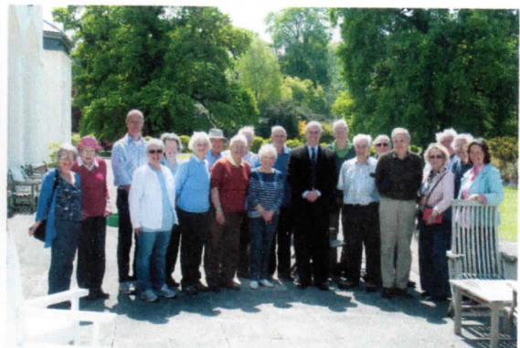
Group Photo with Prince Andrew