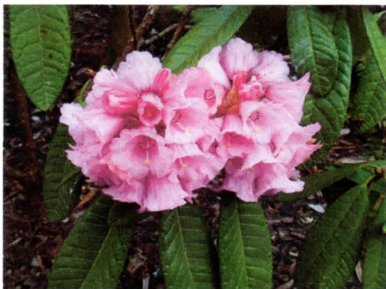
Rh. arboreum Tony Schilling

A beautiful well attended garden again created from scratch which they both must be very proud of.