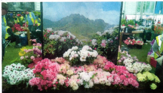
Part of the Display at Chelsea